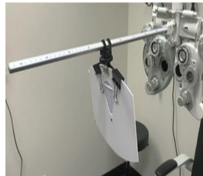
Near VA attachment to Combo Chair and Stand