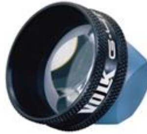
Volk G4 4-Mirror Gonio laser Lens – Flange