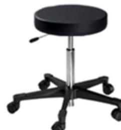
Reliance 4246 Pneumatic Stool