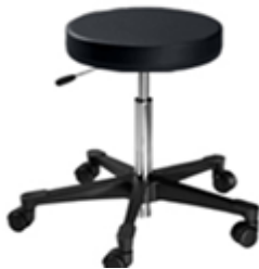
Reliance 4240 Pneumatic Stool