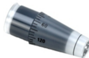
Haag Streit Tonometer Measuring Prism Tip