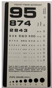
Near Reading Card