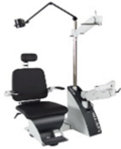
S40PTIK COMBO Chair/Stand