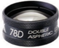
VOLK 78D Slit Lamp Lens Clear