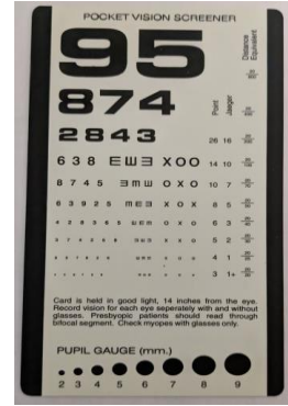
Near reading card