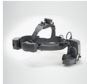
Heine Omega 500 BIO with digital video camera