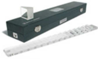
Prisms Bar Set Berens Luneau