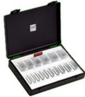
Prism Set Luneau Loose 16 Prisms