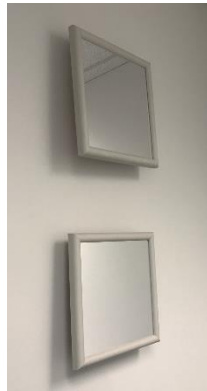
Wall Mirrors x 2