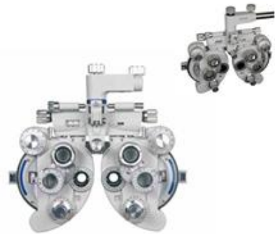
Nidek Manual Refractor – Model Sly – 100