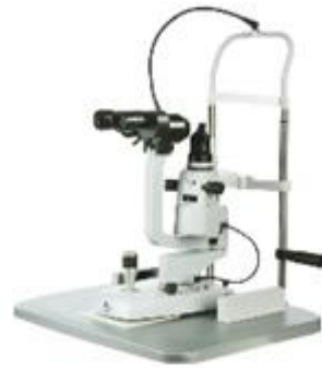
S40PTIK Z2 Led Slit Lamp