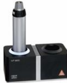
Heine Beta NT Lithium Handle – AV