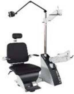
S4 Optik Combo Chair and Stand