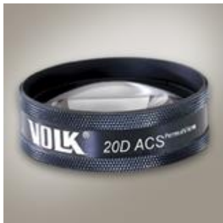
VOLK 20D BIO LENS