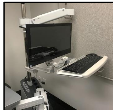
Viewing computer for biomicroscope camera