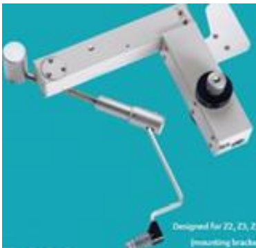
Applanation Tonometer for Z2 Slit Lamp