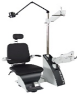
S4 Optik Combo Chair and Stand