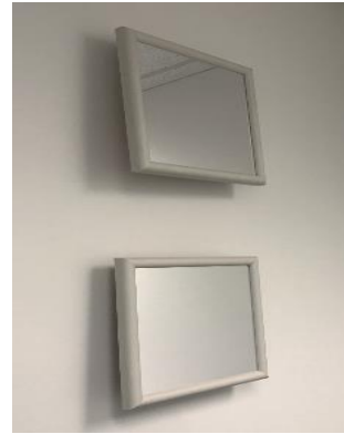
Mirror Shadow Box – Single