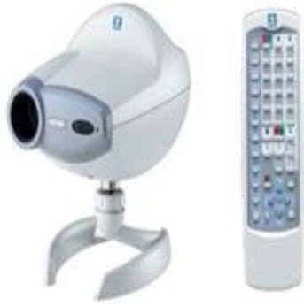
Nidek CP770 Auto Projector with Remote