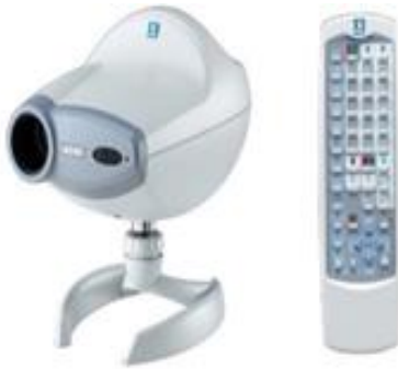
Nidek CP770 Auto Projector with Remote