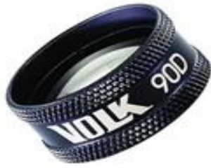
Volk 90D Slit Lamp Lens Clear