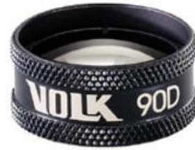
VOLK 90D Slit Lamp Lens Clear